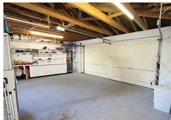
Garage 23'0 x 15'10 (7.01m x 4.83m)